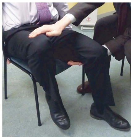
Test contralateral hip flexion against resistance – hip extension has become strong