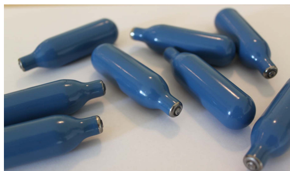
Figure 1 Pressurised whipped cream chargers, known as 'whippits', are a readily available source of nitrous oxide. They are often used to inflate balloons, from which the gas is inhaled.

Humphry Davy first described the anaesthetic properties of nitrous oxide in his book in 1800; already by